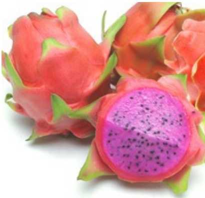
Red Dragon Fruit