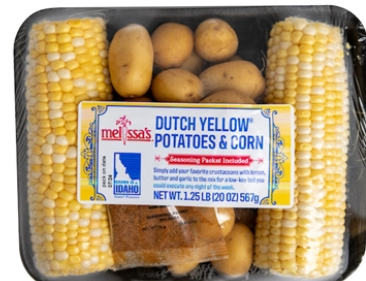
Organic Murasaki Yams